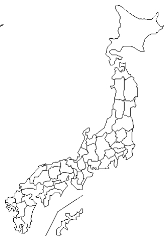
no case Noro NT