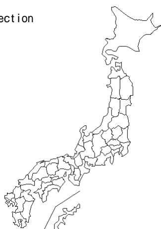
(no case) Rota A